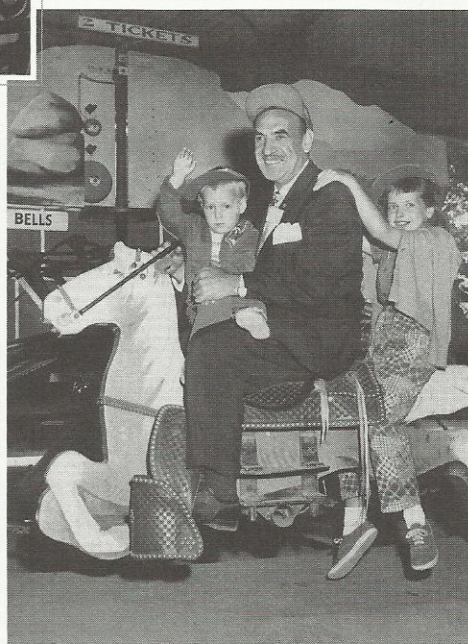
(Below left, far left) Entertained throughout the day by a number of local celebrities including Mayor Anthony J. Celebrezze (below left), and Cleveland Browns star Lou "The Toe" Groza (below far left), over 2,600 youngsters participated in the Cleveland Automobile Club's annual youth day outing at Euclid Beach on Thursday, July 7, 1960. According to The Press, joining the rides and free gifts in popularity were the park's concession stands, where happy youngsters consumed an estimated one and a quarter miles of hot dogs, while satisfying their sweet tooth on ice cream and the park's popular popcorn balls.